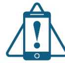
Emergency Mobile Alert

You should still be prepared for an emergency, and you shouldn't wait to get an alert before you act. If you feel your life is in danger, don't wait for an official warning. Take immediate action.